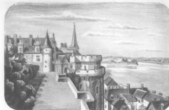
CHATEAU OF AMBOISE