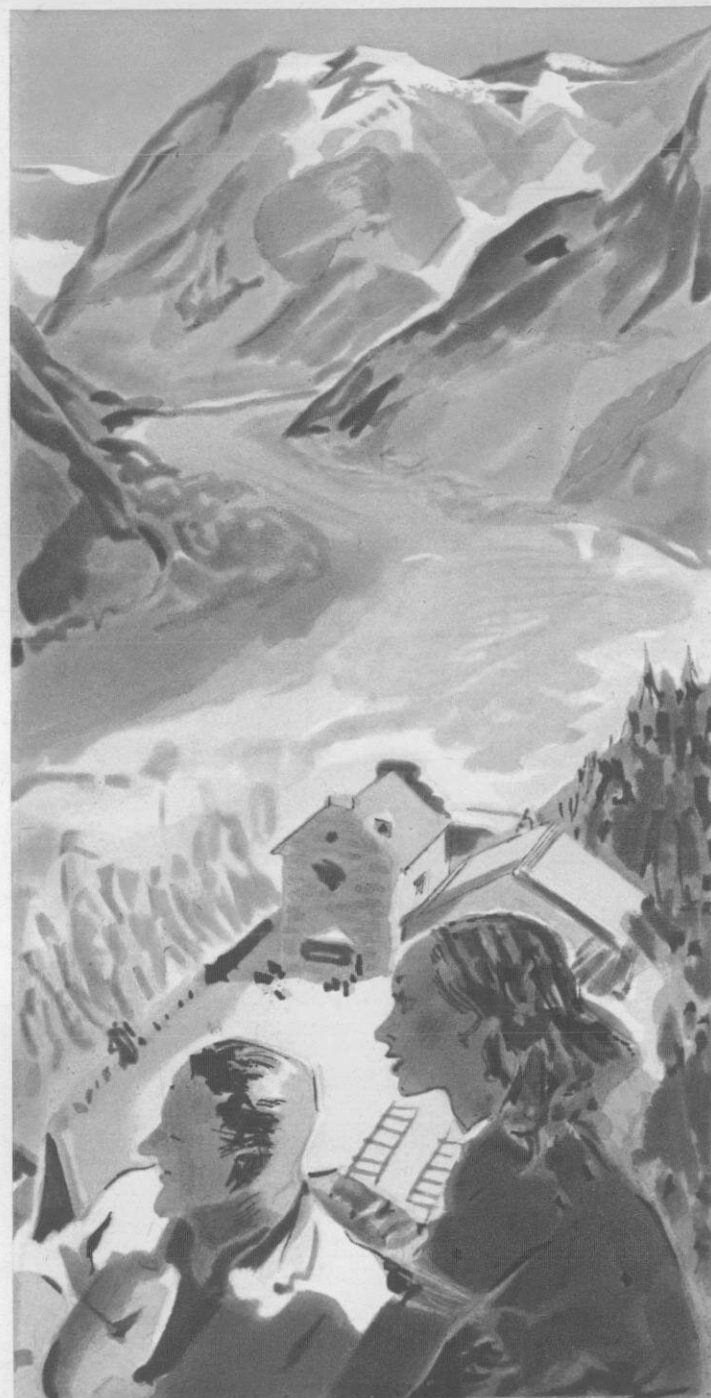
Photo FENINO Printed in France for and by the French National Railroads HAVAS